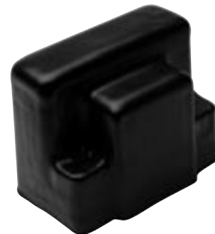
PC R5 Fits R-105 Index Cover