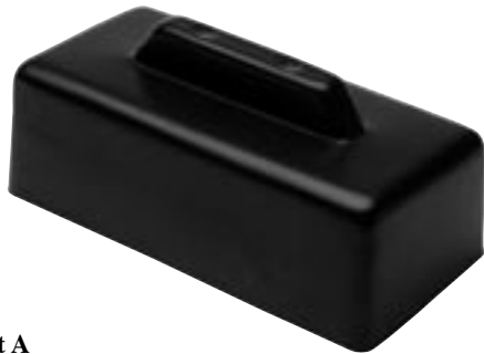
PC Cellnet A Fits Cellnet American