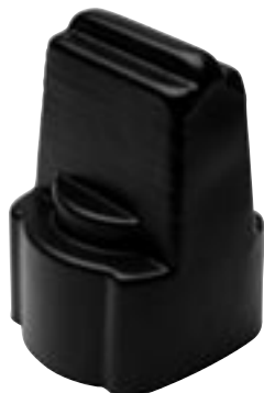
PC A3-40G Fits A-103 Index Cover and Commercial American 40G ERT