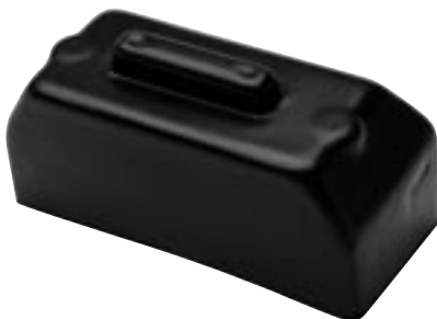
PC Cellnet S Fits Cellnet Sprague