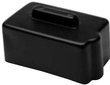
PC Cellnet R Fits Cellnet Rockwell